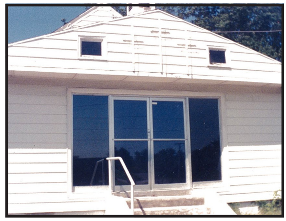
Missionary Baptist Church